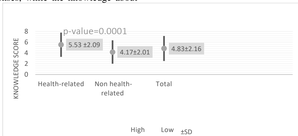
Figure 2. The mean score of the knowledge questions for all participants, health-related and non-health-related students in the University of Kerbala (n=680)

cough syrup intake had been the highest number of correct responses among the 10 items for students in both health-related and non-health-related colleges (figure 3). Health-related college students gave a significantly higher proportion of correct responses than non-health related college students in 8 out of 10 areas including anti-hypertensive medication use, antibiotics use, Acetaminophen (paracetamol) tables and vitamin supplement tables overdose, indications for antacid use, and medication storage for ointments, gels, and changing the effect of medication. The practice of SM within 2018 was 422(62.1%) of the respondents; 208(63%) of health and 214 (61.1%) of non-health students. There was no significant difference in the practice between health and non-health students (table 2).